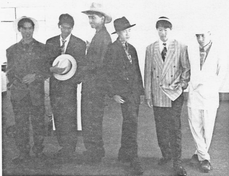
Students from Monta Vista High School Interact Club model for the Fashion Show and Tea

A limited number of The Little Book of English Teas , published by Chronicle Books are available in the Museum for $6.95. Buy yours now for stocking stuffers!